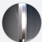
Corrosion-resistant stainless steel structure