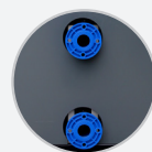
Large-diameter fittings for professional ponds