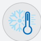
Wide operating range down to -15°C