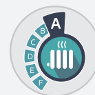
SCOP A Energy efficiency level of an appliance in hot mode