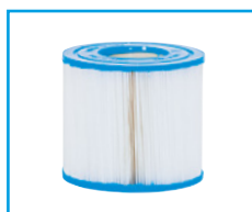
Cartridge Filter cartridge included