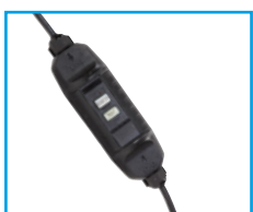
Secured plug 10 mA 100% safe against electrical hazards. Integrates a differential circuit breaker 10 mA.