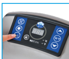
Smart motor block Automatic temperature control.