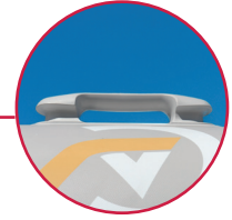
Rigid front handle