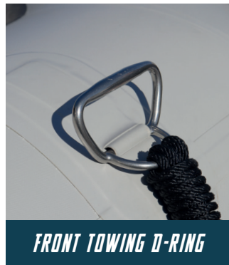
FRONT TOWING D-RING