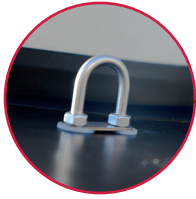
2 lifting rings