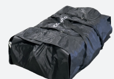
Foldable transport bag