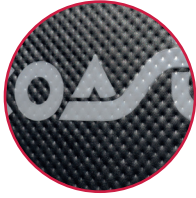
High-pressure drop-stitch floor