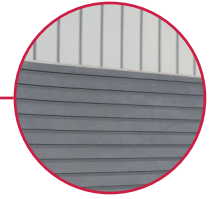
Extra comfort with EVA