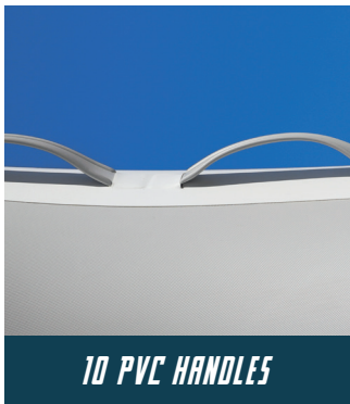
10 PVC HANDLES