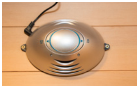
Cabin purification with ionizer