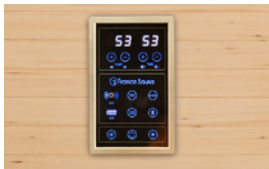
New generation digital control panel